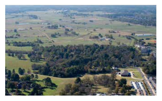
The MAFES H.H. Leveck Animal Research Center at Mississippi State University.

MSU's campus and the MAFES H.H. Leveck Animal Research Center (South Farm) are located in the headwaters of the Catalpa Creek Watershed which presents numerous opportunities for leveraging numerous MSU activities and assets. Of all the land grant universities in the United States, South Farm is one of the largest land reserves adjacent to a university campus. It encompasses about 1,600 acres used for cattle, equine and poultry management research. South Farm also hosts a NRCS Grazing Lands Conservation Initiative demonstration site. 18 acres of aquaculture ponds, and various water quality research projects. These projects include monitoring nutrient and sediment runoff under varying climatic conditions and cattle management scenarios, comparison of hydrologic modeling outcomes to evaluate pre- and post-BMP implementation related to dairy and poultry management, identification of potential environmental problem areas throughout South Farm that could impact Catalpa Creek, and development of baseline water quality information and a monitoring plan for Catalpa Creek.